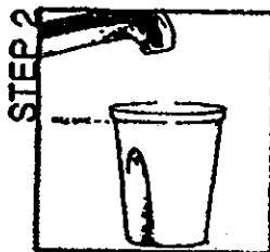
STEP 2 Add cool drinking water to the 16-ounce line on the container and mix.