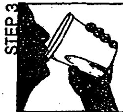
STEP 3 Drink ALL the liquid in the container.